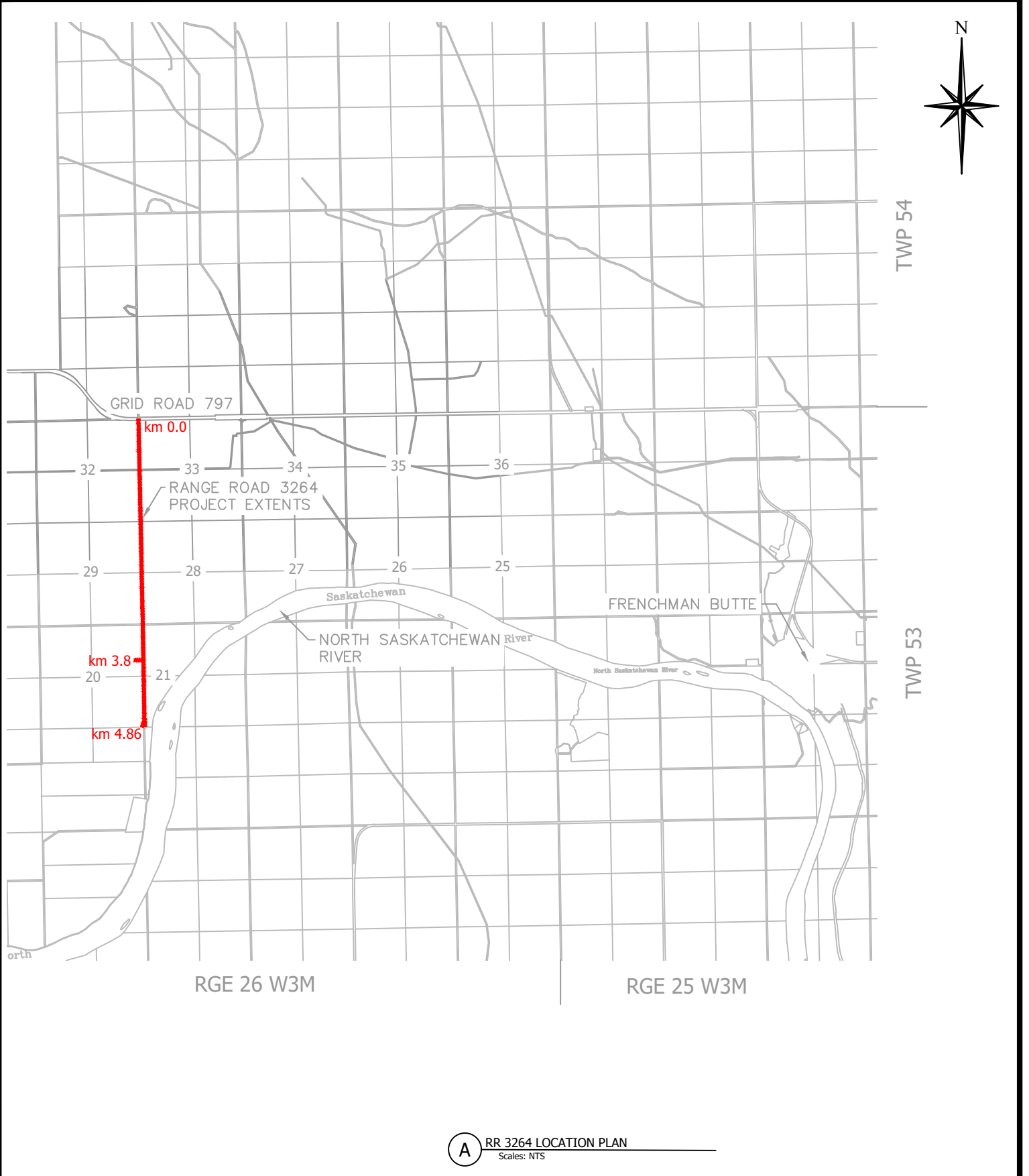
A RR 3264 LOCATION PLAN Scales: NTS

P: \Municipal\26MU-728200 RME RR3264 Surface Strength\400-Drawings\Figures\26MU-728200 - Figure 2.1 - Location Plan.dwg Layout: 8.5x11 Page Last Saved: Apr 20, 2026 - 3:51 PM Plotted: Mon